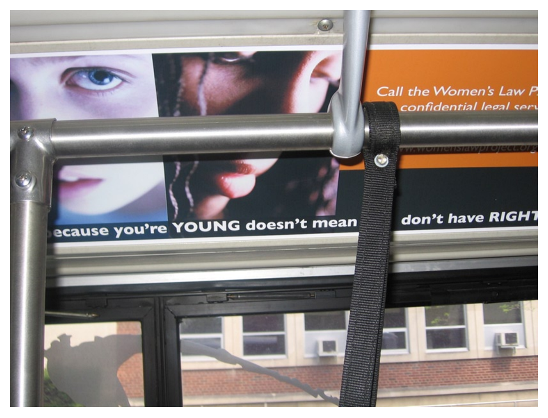
Exhibit 4 - B