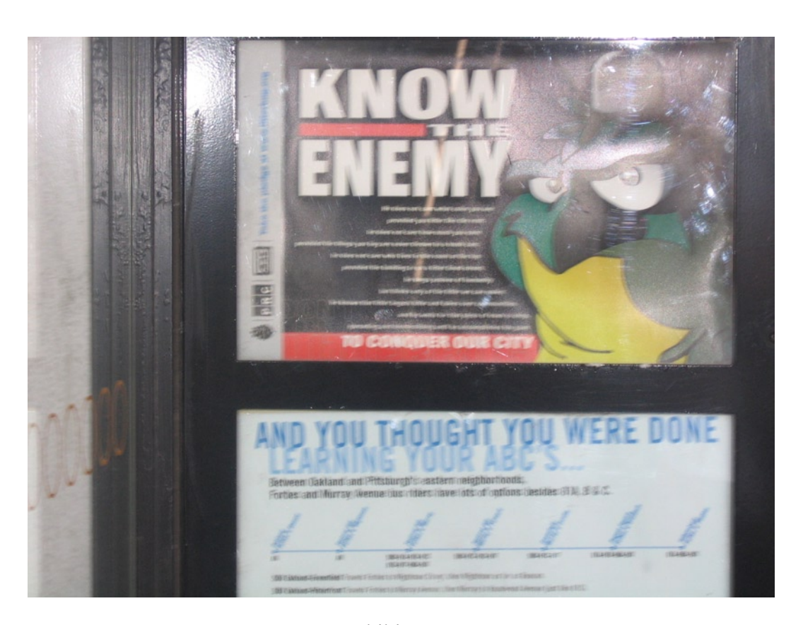
Exhibit 4 - D