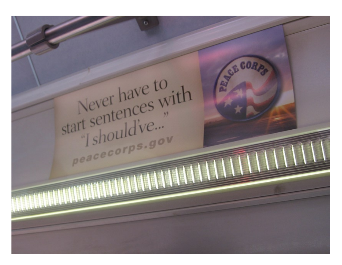
Exhibit 4 - A